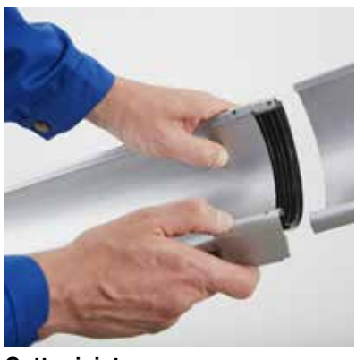
Gutter joint These joints are easy to fit, creating very firm, durable joints. The joints are guaranteed leak-proof with a long-lasting EPDM sealing.

This holder is made from only one piece of sheet steel and mounts a pipe with one firm grip. There are no accessories to be lost or mounted askew.